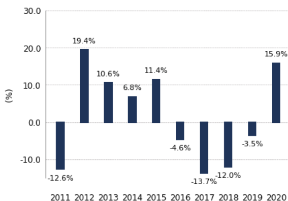
Farringdon Alpha One - Class A

The Sub-Fund and Class A Shares were launched in November 2006.